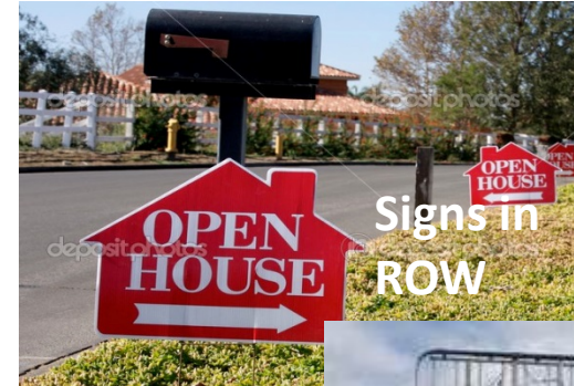
Signs in ROW